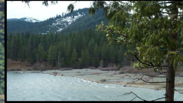
Seasonal: Area open May - October, weather dependent